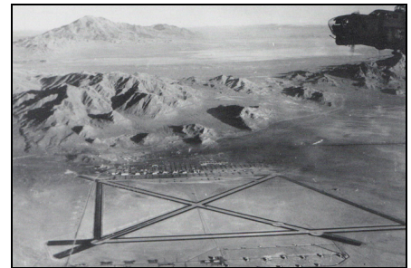
Wendover Air Field in Utah, where crews trained for dropping the world's first atomic bombs.